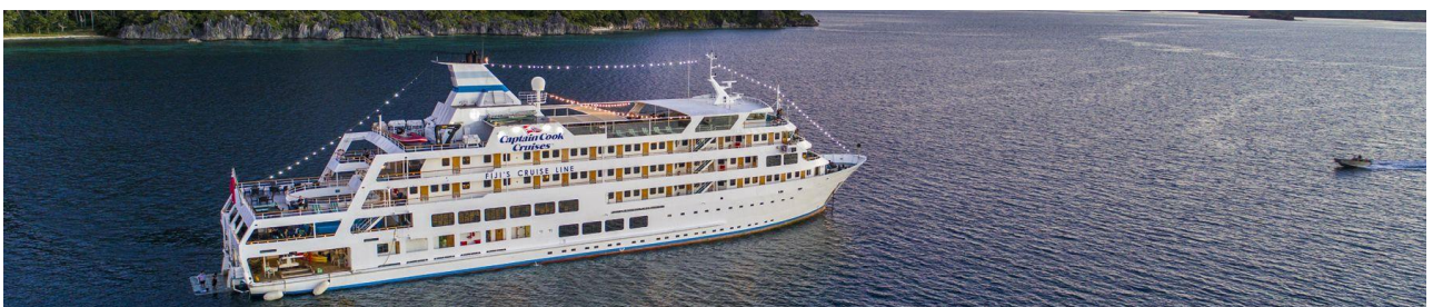
- Adrift in Fiji -